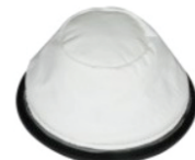
耐高温油过滤器 Temperature and oil resistant filter