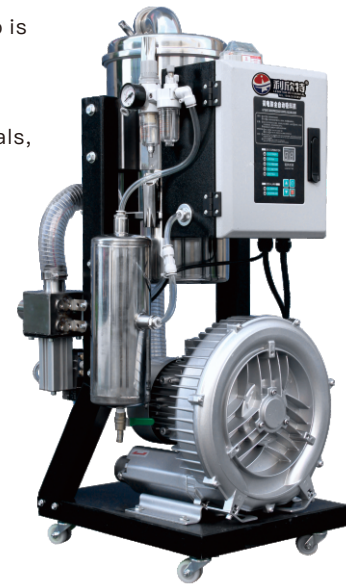
950/960型除尘 950 / 960 dedusting type

It is suitable for new granular materials, color masterbatch, broken recycled materials, materials with good fluidity, as well as materials with large amount of powder mixing in the process of granular coloring powder raw materials and crushing. (not suitable for addition of more than 20% powder or all powder)