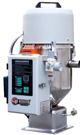
350型除尘 350 type dust removal